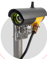
SEARCHLINE EXCEL Plus / Edge Infrared Open Path Gas Detector