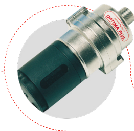
SEARCHPOINT Optima Plus Infrared Point Gas Detector