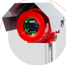
FS24X Plus Triple Infrared Flame Detector