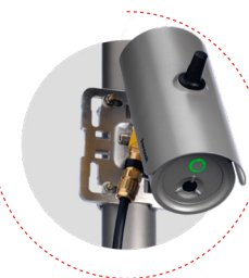
SEARCHZONE Sonik Ultrasonic Gas Leak Detector

There are different types of gas and flame detection technologies to choose from. The selection process will ultimately depend on the industrial application, hazardous gases involved, and risks to workers, which should always be identified through assessment of the risks.