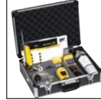
Sampler in a Confined Space Kit