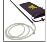
Collapsible sampling probe

For a complete list of accessories, please contact BW Technologies.