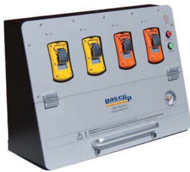
SGC Wall Mount Dock