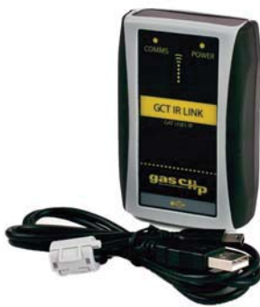
GCT IR Link