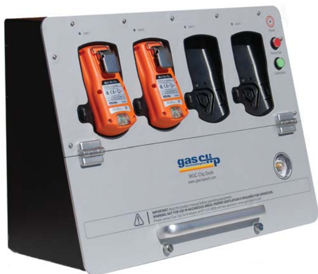
MGC Wall Mount Dock