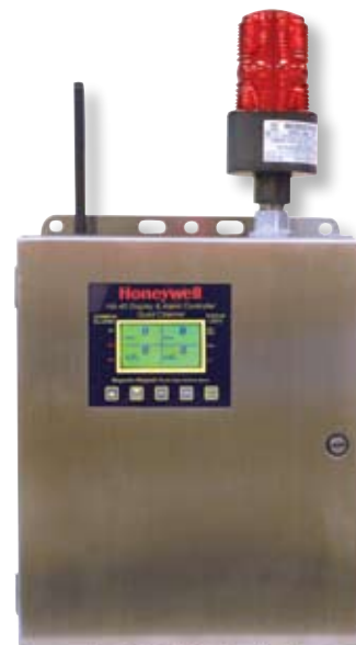
Optional Stainless Steel Enclosure available for HA-20 & HA-40