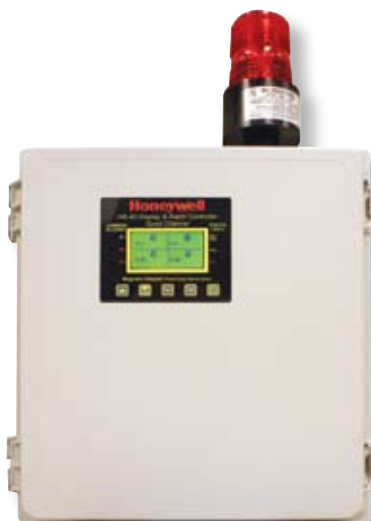
Standard Polycarbonate Enclosure available for HA-20 & HA-40

Other HA-40 options include an RS-485 Modbus slave port that allows up to 128 HA-40's to be multi-dropped onto a single data highway for interrogation by another Modbus master; choice of six programmable 5 amp SPDT discrete alarm relays; 4-20mA outputs; light stacks; and audible enunciators. HA-20 options include 5 amp SPDT discrete alarm relays per channel; 4-20mA outputs; light stacks; and audible annunciators.