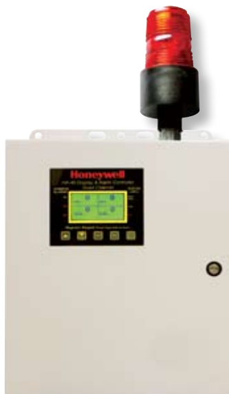
Optional Painted Carbon Steel Enclosure available for HA-20 & HA-40