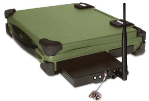
RDK Ruggedized Host with integrated RAELink modem device bay