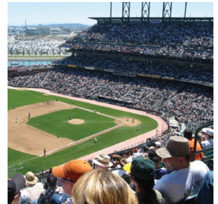
ProRAE Guardian is ideal for threat monitoring and detection of large-scale public venues