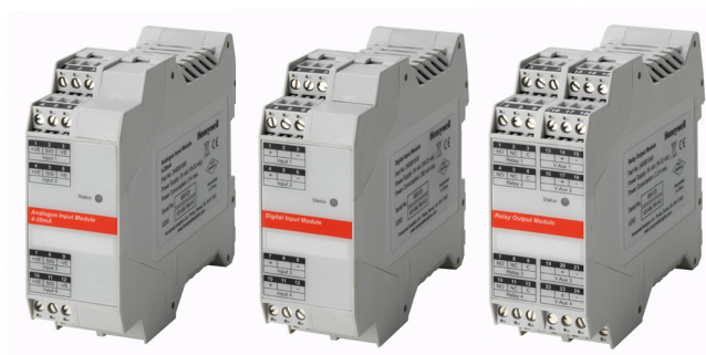
Analogue Input Module, Digital Input Module and Relay Output Module

Touchpoint Pro uses a simple 'building block' approach which provides unrivalled flexibility. The simple plug-in Input / Output (I/O) Module, one of four key building blocks that form the Touchpoint Pro system, allows for easy expansion.